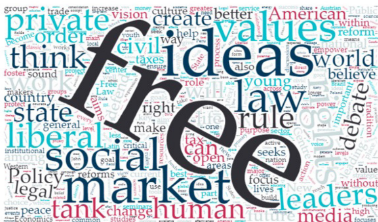
This word cloud is built from the mission statements of Atlas Network’s 502 partners.

and developing parts of the world where the freedom movement was fragile (or completely barren) only ten years ago. It’s truly inspiring to attend our Asia Liberty Forum or Africa Liberty Forum and take stock of the rising young leaders with principled and pragmatic plans for increasing freedom in their countries.